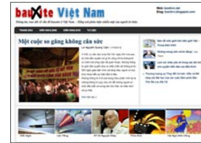
← Home page of Bauxite Vietnam created on 2009