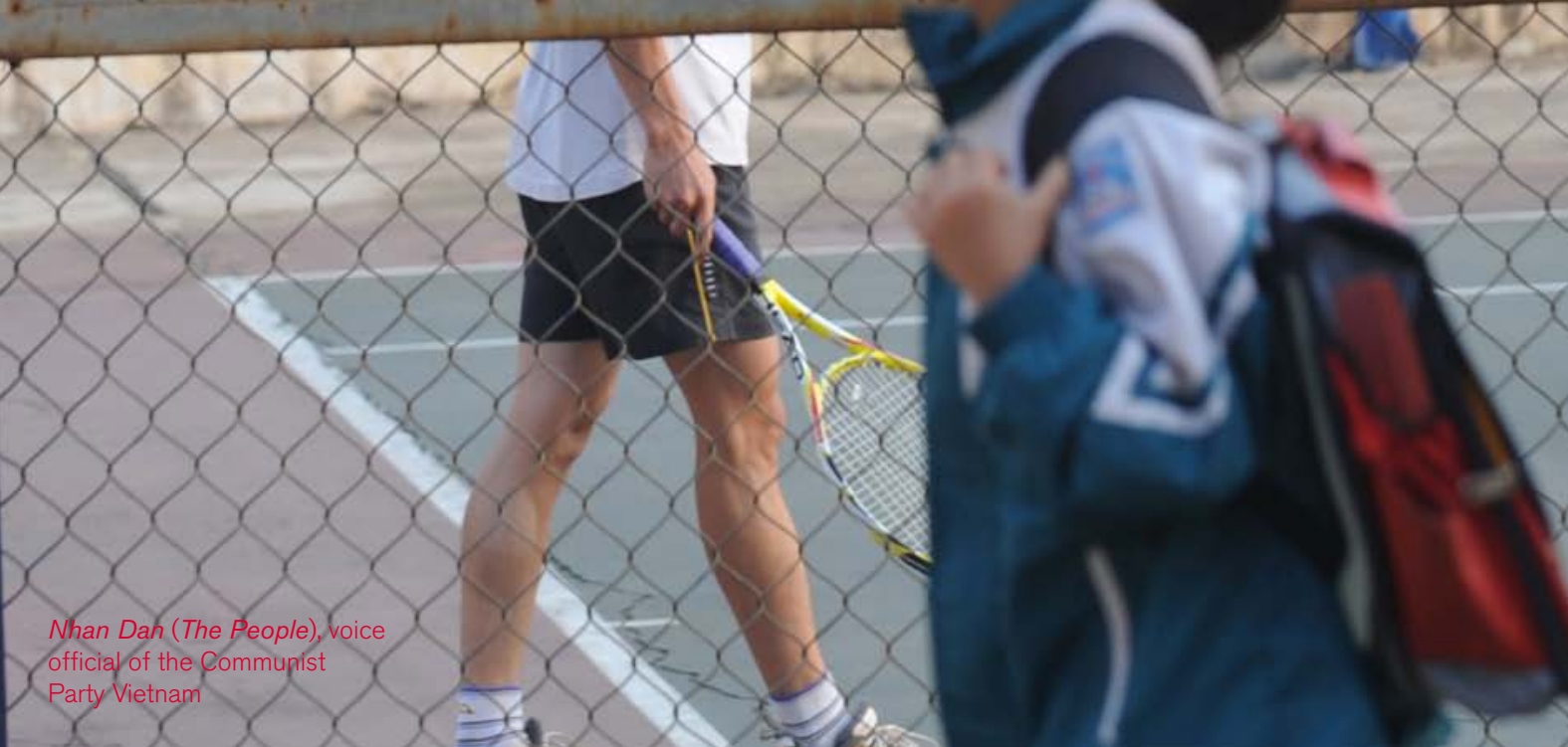
Nhan Dan (The People) , voice official of the Communist Party Vietnam